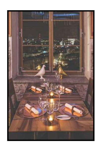
IKD, Harmonizing the Highest Standards since 1964